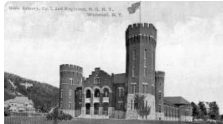
State Amory of the Co.1- 2nd Regiment, N.G.N.Y.-Whitehall, New York

Then, in combination with the canal traffic, the railroad appeared in town. First, the Rensselaer & Saratoga completed a rail line to Whitehall in 1851. Working in conjunction with the steamboat lines, the railroad made a 682-foot long tunnel to a point on the lake north of town. There, at Lake Station, trains met steamboats and transferred passengers. Another line, the Rutland & Whitehall soon headed east into Vermont. Rails had established ties to the south and east, but the path north along Lake Champlain lay undeveloped for many years.