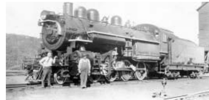
Delaware and Hudson Railroad, Whitehall, New York