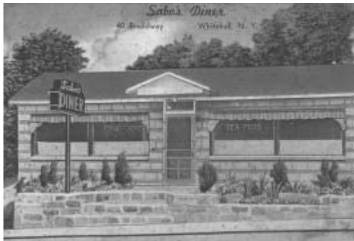
Now the home of Captain's Restaurant

In 1776, Skenesborough served as a supply depot for materials coming north from Albany. Troops passed through the village on their way north. When the American army retreated from Canada in June 1776, the waterfront drastically changed. To match the navy the British constructed on the Richelieu River, the Americans, under the direction of General Benedict Arnold, turned Skenesborough into a shipyard. Using the forges and sawmill of Philip Skene and other mills in the region, American shipwrights constructed a fleet from local timber. By the fall, they built a total of twelve vessels. Due to this military activity, Whitehall proudly states it as being "The Birthplace of the United States Navy." The warships soon found themselves at the Battle of Valcour Island, an engagement that helped to forestall the British advance southwards in 1776.