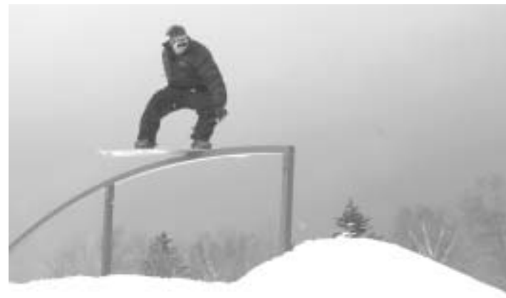
Riding the rails, 21st century style, in Bromley's Halo Free-Style Park

Just as Bromley was an innovator in skiing's early years, it more than keeps up with the times now. Thanks to an extensive, ongoing capital improvement campaign that began in '99, Bromley has since cut new trails and glades, expanded and upgraded snowmaking, added several new terrain parks for skiers and snowboarders of all ages and abilities, installed a new high-speed quad lift, completed