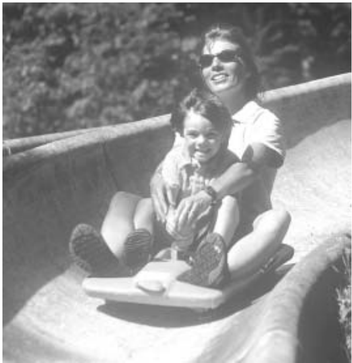
The Thrill Zone's Alpine Slide - Still the longest

A fun park needs a name of its own, and so the Bromley Mountain Thrill Zone opened for business in the Summer of 2000. Vermont's largest summer fun park, the Mountain Thrill Zone, now hosts the 456' Big Splash, Vermont's longest water slide ride; the 100' Adrenaline Zip Line; two Trampoline Things that let you flip, spin and jump some 25' in the air (all harnessed in, of course); a 24' multi-faced climbing wall and a beautiful, 18 hole championship mini golf course.