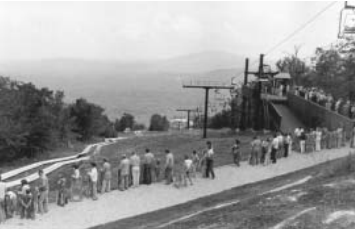
Bromley's original Alpine Slide, circa late 1970s

And so, in the summer of '76, Bromley Mountain unveiled the Bromley Alpine Slide. It was the nation's first double-tracked Alpine Slide (the third track was added in '78) and as of this writing, it's still one of the country's longest at 2/3 of a mile long. The Alpine Slide remained the only summer game in town until some twenty years later when Bromley's longtime President looked up and thought something like, "Wouldn't it be nice to give the folks a variety of summertime rides and attractions suitable for the whole family?" It would indeed be nice and fill a seasonal void, he reasoned, and began, in the early 1990's, to experiment with various diversions. More attractions were added until, sometime around 2000, it dawned on everyone that what they had on their hands was a full-blown, Vermont-style fun park.