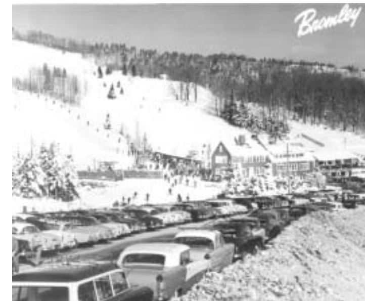
A busy day at Bromley, as seen from VT Route 11, mid-late 1950s

a major base lodge expansion and renovation and completely redesigned its entrance way, added a wide and welcoming front plaza, a grand heated staircase and, on weekends and holidays, the first valet parking service at a Vermont ski area (there we go again!).