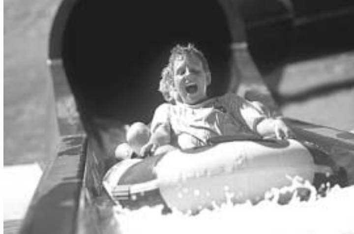
Bromley's Thrill Zone's 456' "Big Splash," Vermont's longest water slide ride.

Published by The Historical Pages Company ©2005 (802) 287-2332 • www.historicalpages.com • Printed by Journal Press, Poultney, Vermont (802) 287-9811